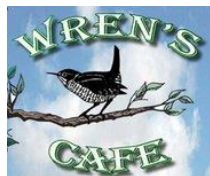
Merchant Street, Vacaville