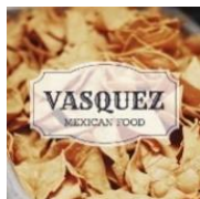
E. Main Street, Vacaville