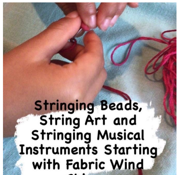
Beads and Musical Art