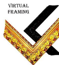
Solano Town Center, Fairfield