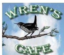
Merchant Street, Vacaville