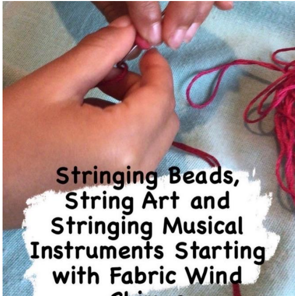
Beads and Musical Art