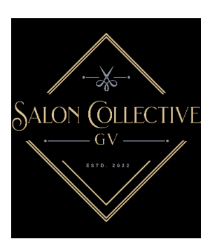
Salon Collective GV 4171 E Suisun Valley Road Fairfield, CA