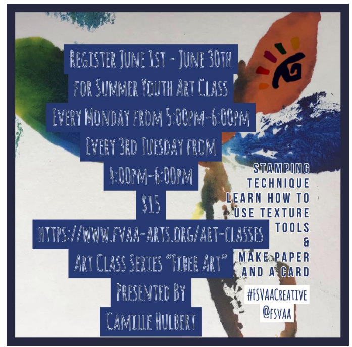
One-hour art class taught in the Solano Town Center Gallery

<u>Community Art Class Registration | fsvaa (fvaaarts.org)</u>