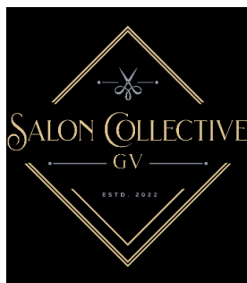
Salon Collective GV 4171 E Suisun Valley Road Fairfield, CA