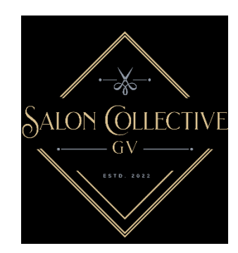
Salon Collective GV 4171 Suisun Valley Road, #E, Fairfield