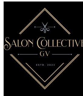
Salon Collective GV 4171 E Suisun Valley Road Fairfield, CA