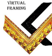
Solano Town Center, Fairfield